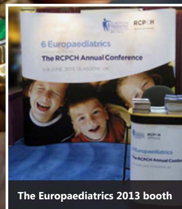
The Europaediatrics 2013 booth

EPA-UNEPSA's presence as an exhibitor confirmed the Society's role as an international advocate of the values of European paediatric best practice and research.