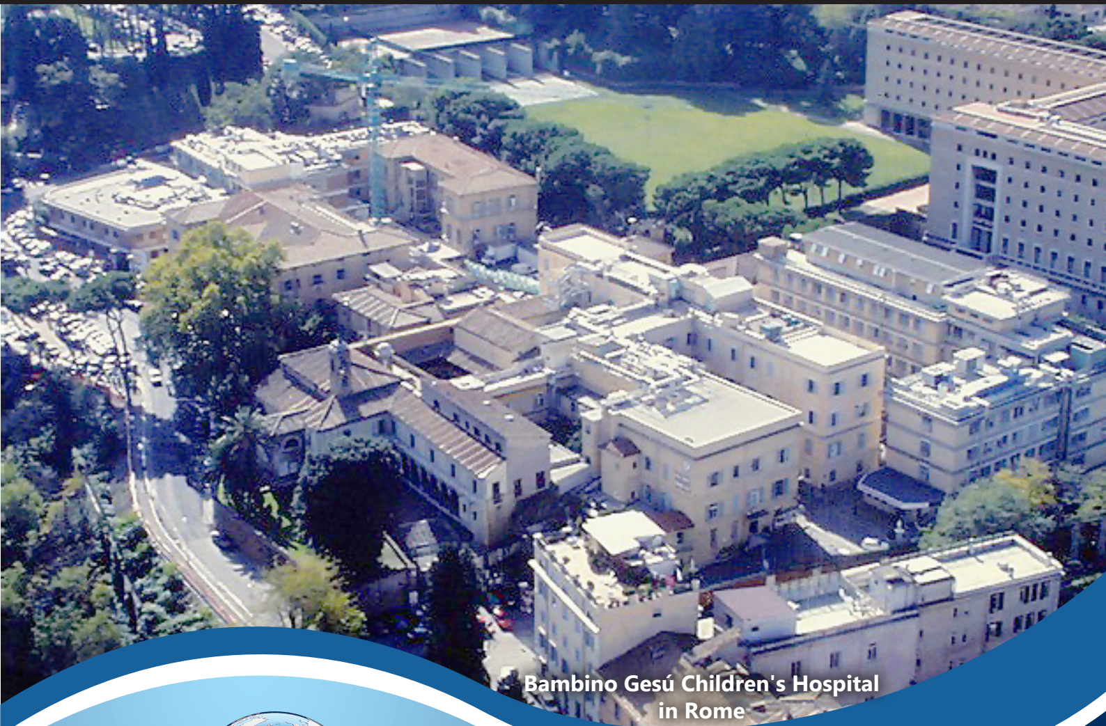
Bambino Gesù Children's Hospital in Rome

The 10 th Congress of the Croatian Pediatric Society